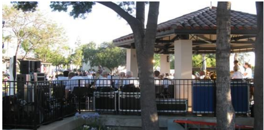
The new Gazebo is BEAUTIFUL!