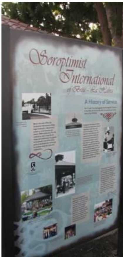
Our Gazebo and Club's Service History